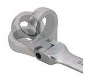
Inversible joint: Unbeatable in tight places!