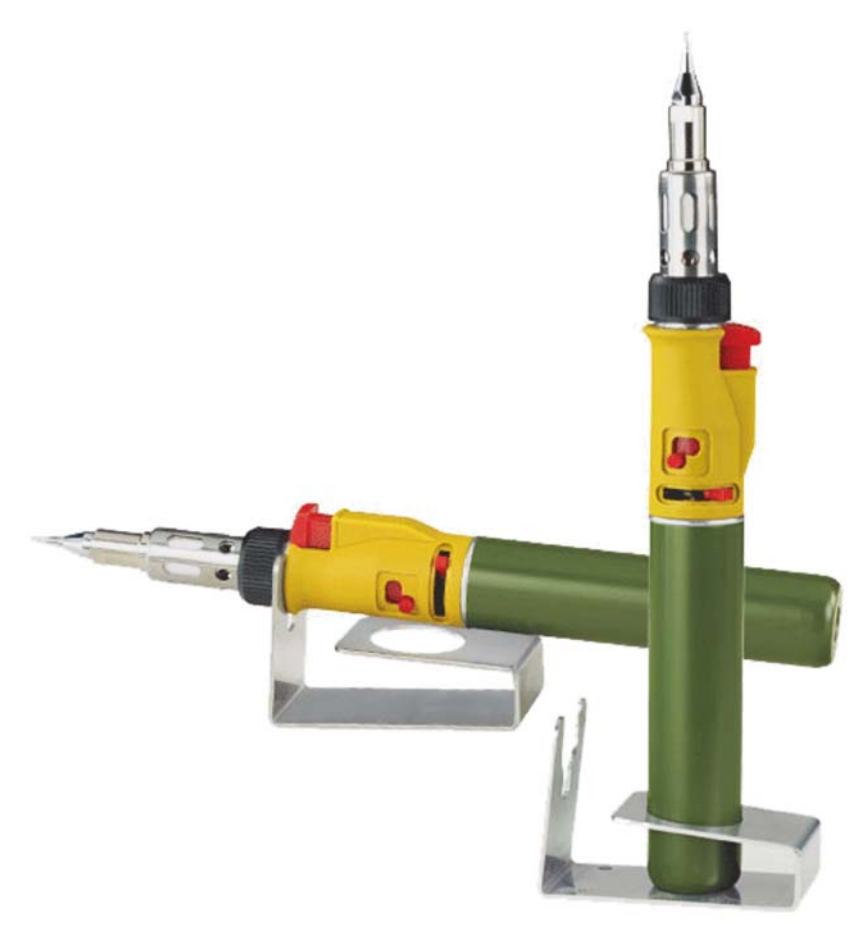
A practical stainless steel base also enables stationary work.