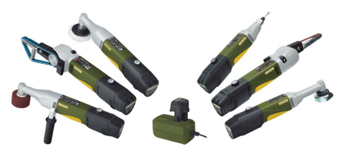
Six power tools - one system!